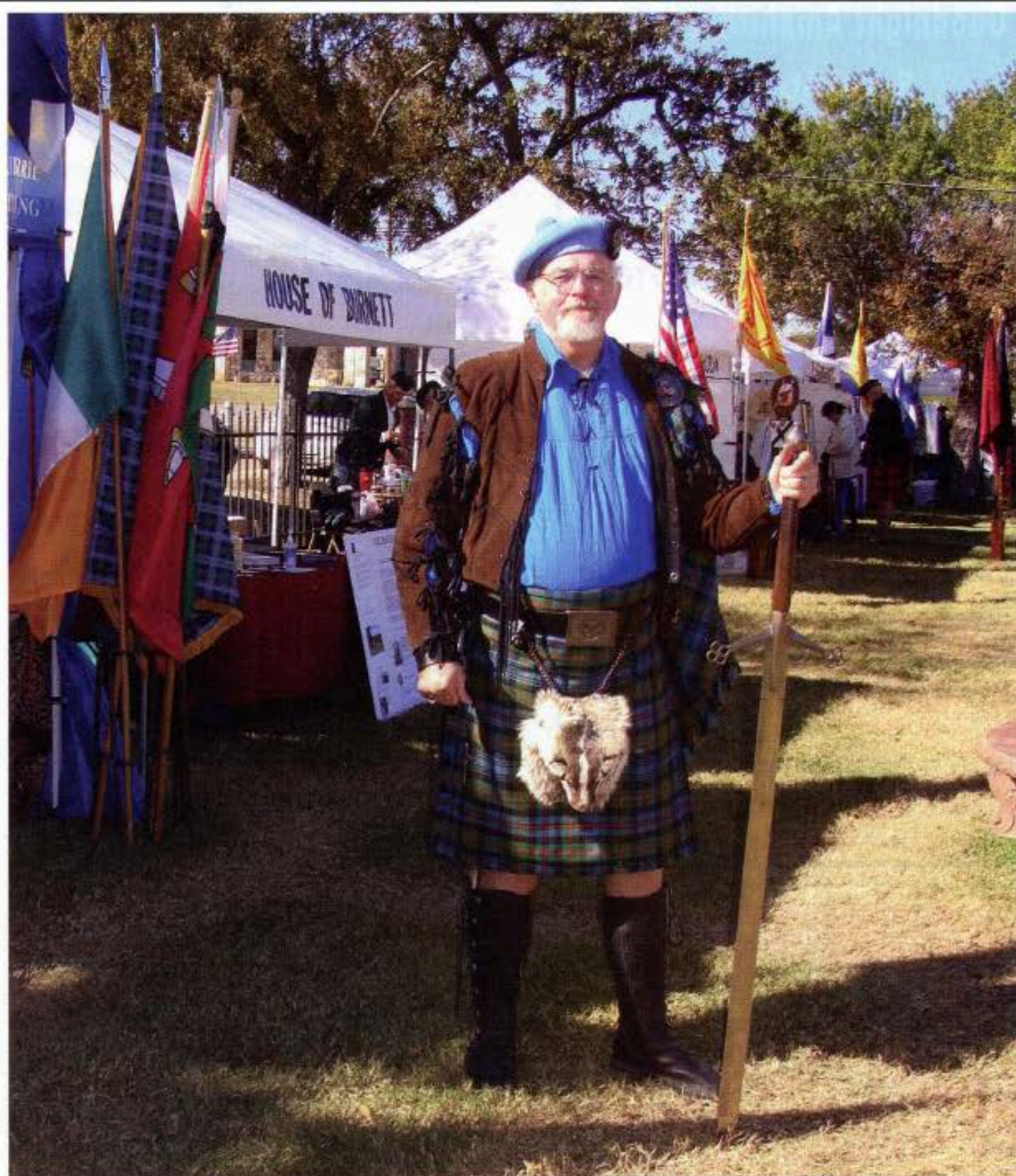
The 50th annual Highland Games will draw people celebrating their Scottish ancestry to Salado for a variety of activities.

Visitors on Saturday can peruse the wares of Scottish vendors, enjoy Scottish and Celtic music and storytelling, or watch clan members