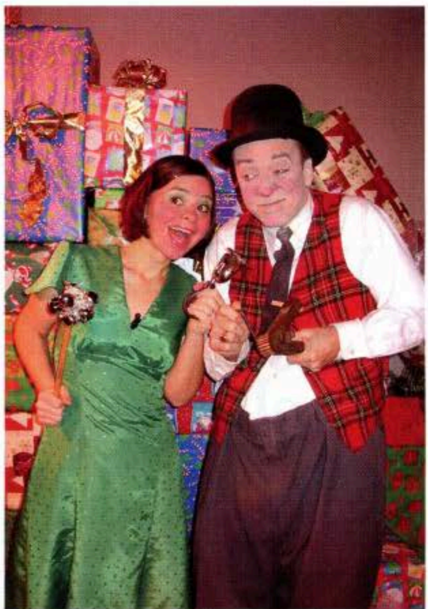
A radio show goes awry in the play "Christmas Is on the Air."

The Salado Silver Spur Theater, accessible from exit 284 off I-35, presents its holiday production,