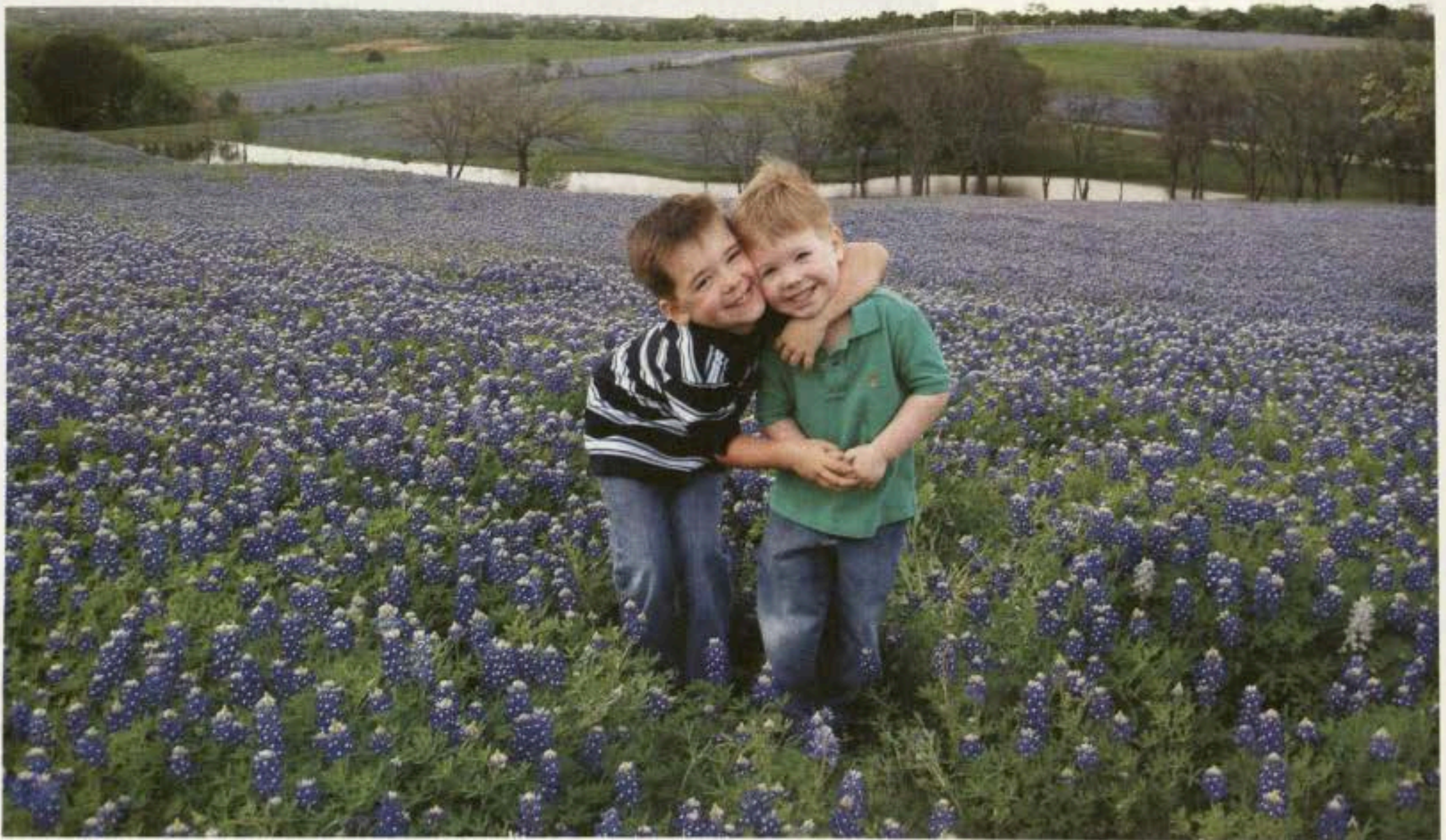
A favorite spot each year on the Ennis Bluebonnet Trail is this field along Sugar Ridge Road near Bristol, a small community a few miles north of the city.