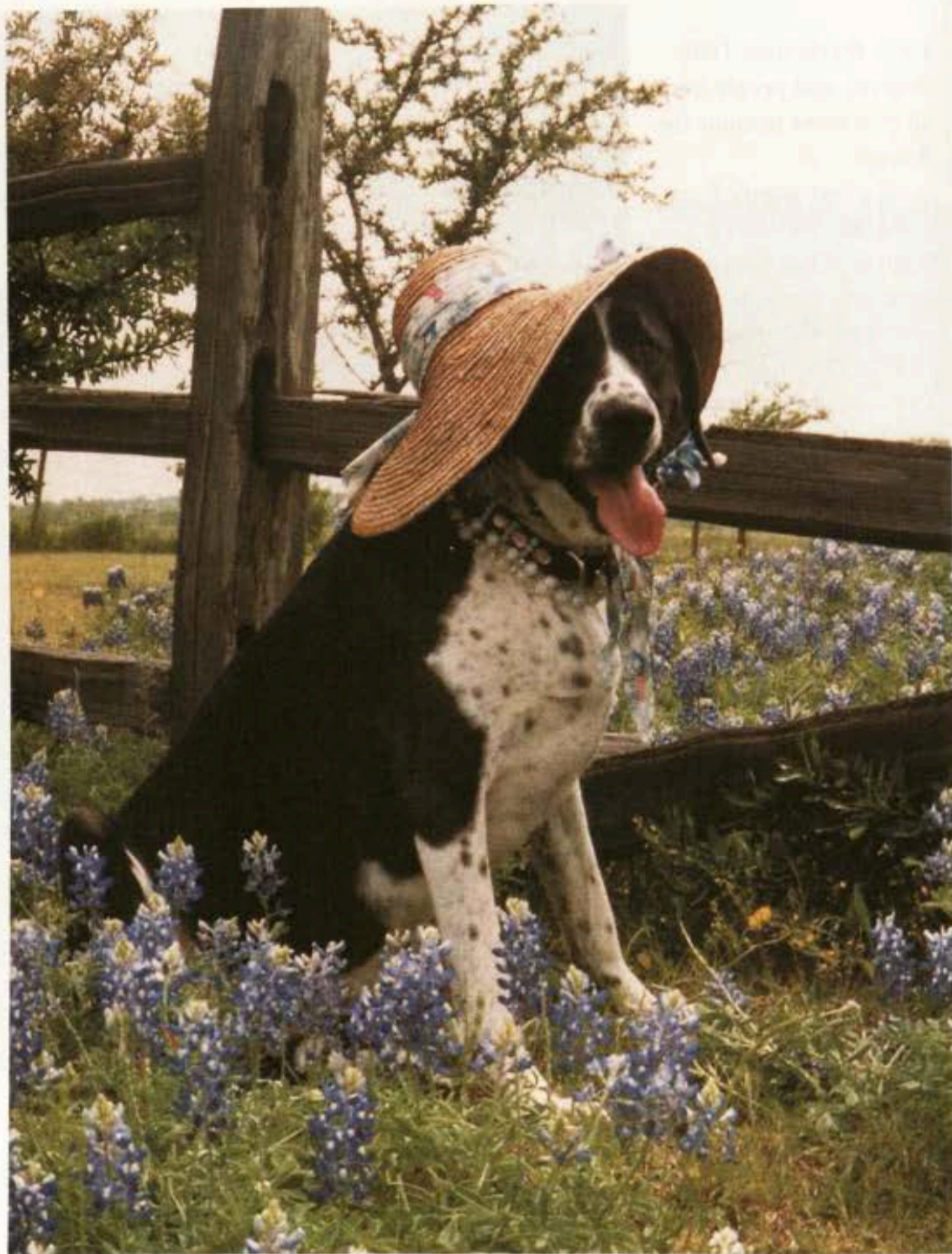
Some people can't resist dressing up their pets for a photo in the bluebonnets.

These photos and many more are available to buy at www.wacotrib.com