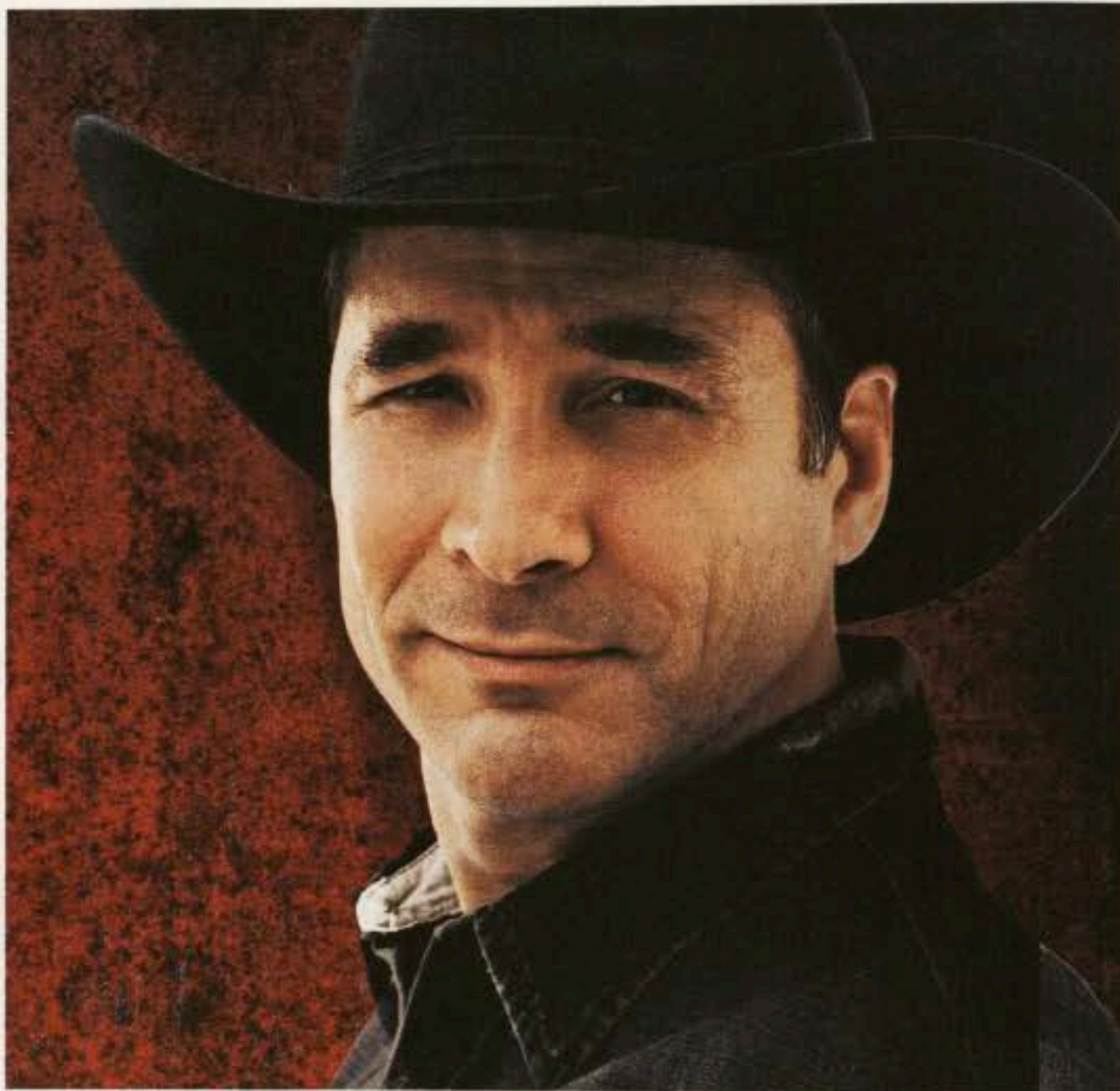
Country star Clint Black will perform at the 2012 Cattle Baron's Ball.

Information: Call 254-753-0807 or visit WacoCattleBaronsBall.org .